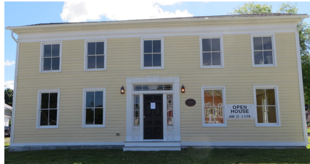
Mary Helen Joint Meeting House 7 McCoy St. Savona, NY 14879