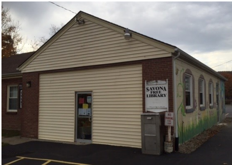
Savona Free Library 15 McCoy St. P.O. Box 475 Savona, NY 14879